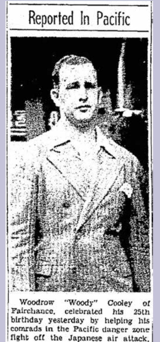
The Morning Herald Uniontown , Pennsylvania December 8, 1941