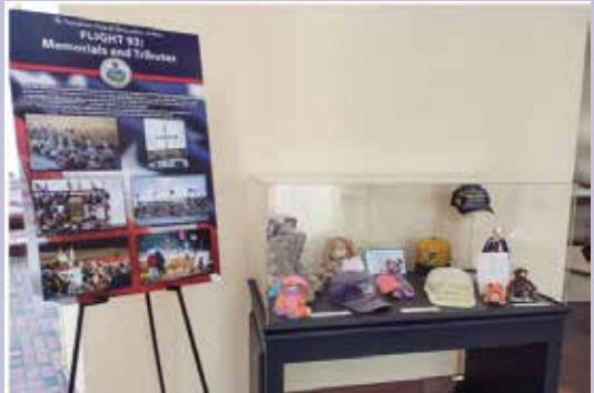
Above: cases including tributes left at the Flight 93 Memorial in Shanksville, Pennsylvania.