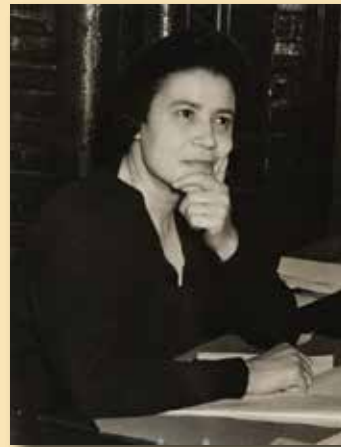
Left: Representative Crystal Bird Fauset, Philadelphia, 1939-1940, was the first Black woman elected to any state legislature in the nation.

Be sure to follow the Archives on social media for updates on this project as well as Black History Month features!