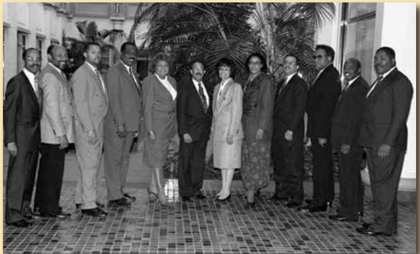
Members of the Pennsylvania Legislative Black Caucus 1980s